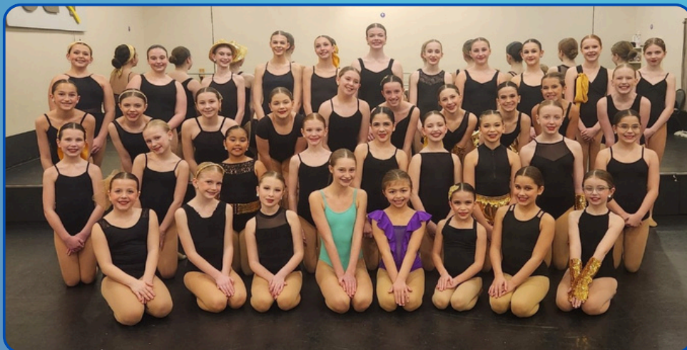
PETITE & JUNIOR MISS DANCE PERFORMERS