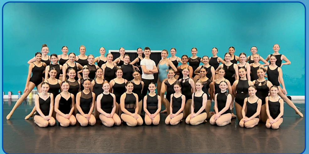
TEEN MISS & MISTER DANCE PERFORMERS